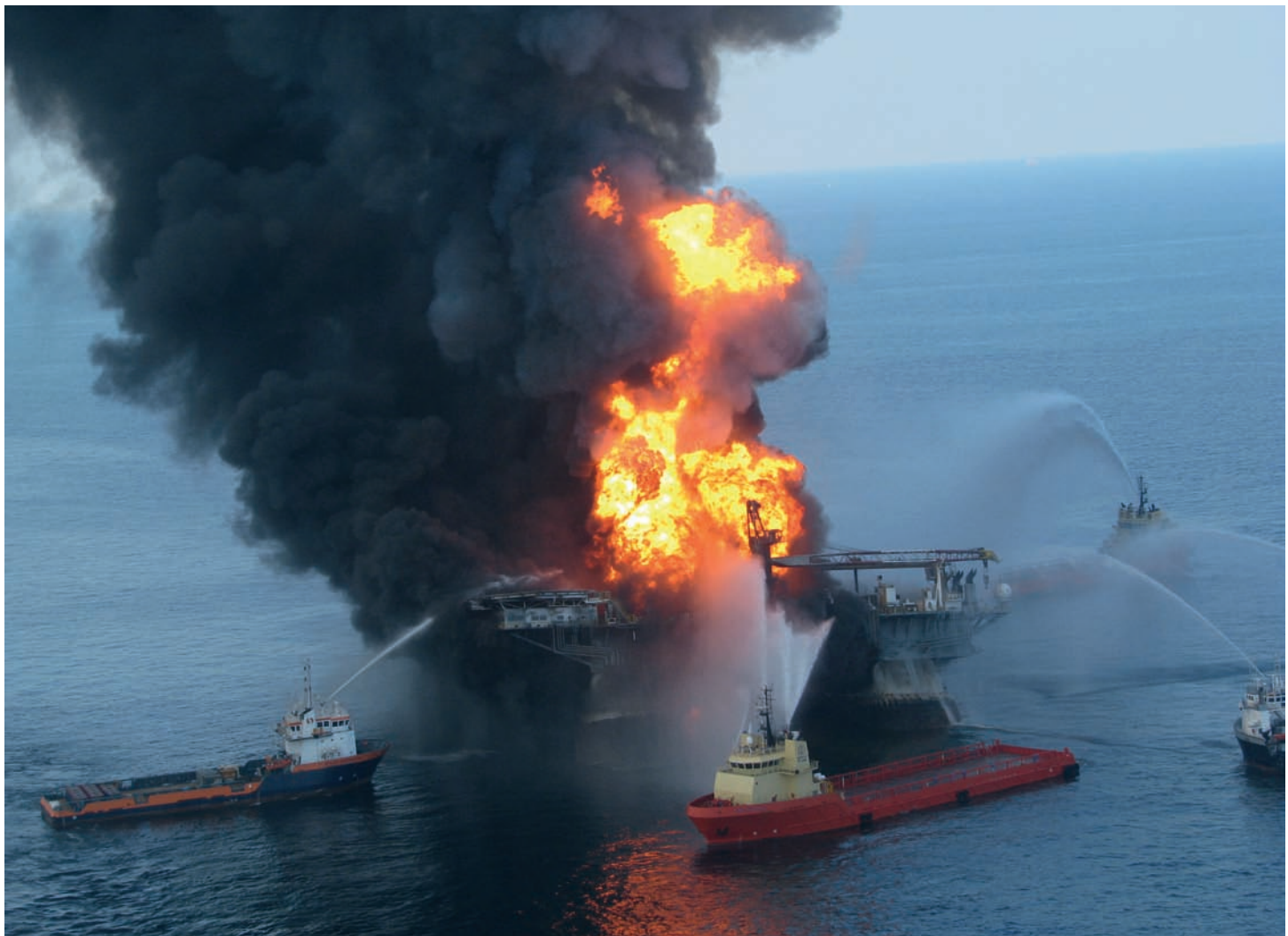
Deepwater Horizon offshore drilling unit on fire.

and privately among the BP technical and public relations staff. Recent documentation suggests that requests by NOAA to inform the public of the worst case discharge rates were quashed by the White House 17 . The events of April to July 2010 are rapidly entering the legal arena, from which it will take years for the truth to emerge, if it ever does. The facts at hand do show, however, that the authorities initially presented the public with an apparent consensus opinion regarding the rate of discharge. This rate was lower than the present best estimate by an order of magnitude. In choosing to believe this rate, the authorities ignored the strongly contradictory evidence offered by videos of jetting oil and refused to consult independent experts who could have provided better analyses. Indeed, BP resisted releasing video for many weeks until forced to do so by threat of Congressional subpoena 18 . They also chose to overlook the stark warning from BP's own engineering team. This warning, of the "worst case" discharge rate of 60 000 bopd (Figure 1(b)), is eerily close to the final accepted discharge rate.